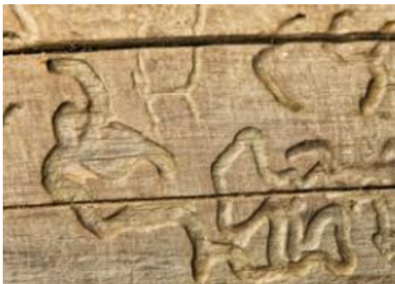
Example: Woodworm Tunnel