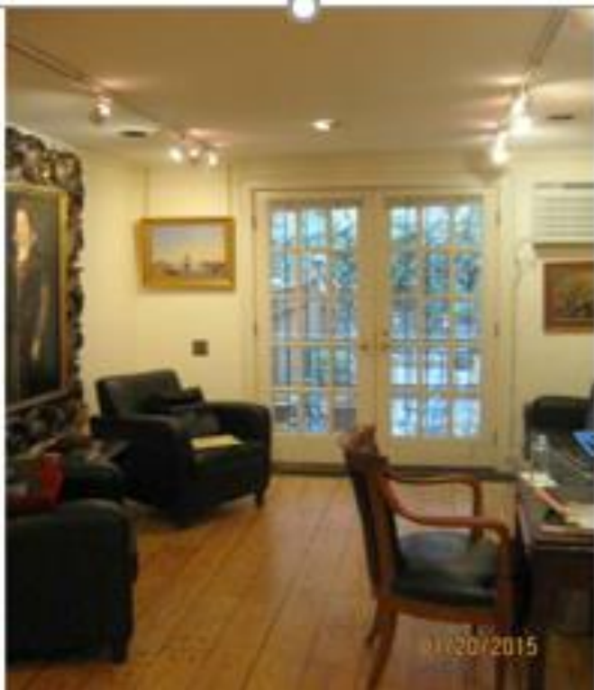
Back of gallery; painting hung before desk; humidifier noted with arrow