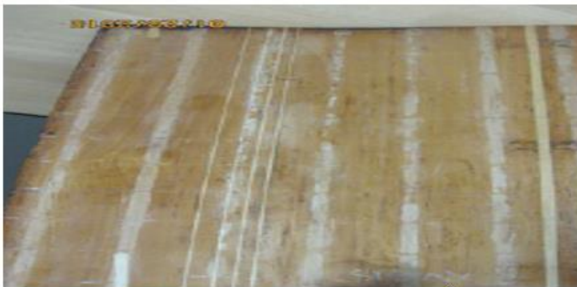
Actual Painting; tunnels noted with arrow