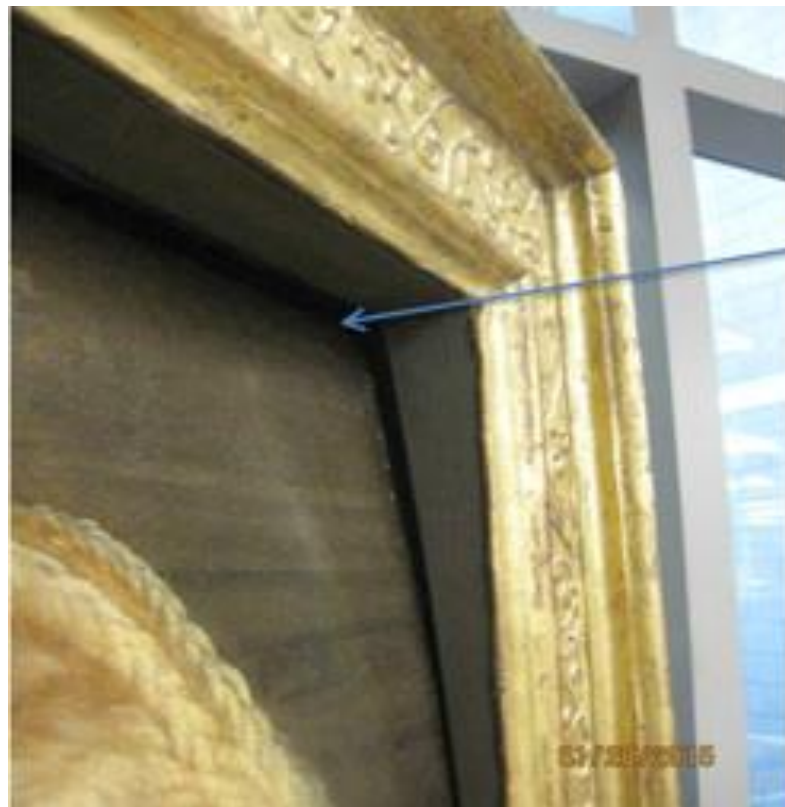
Space where bowing occurred