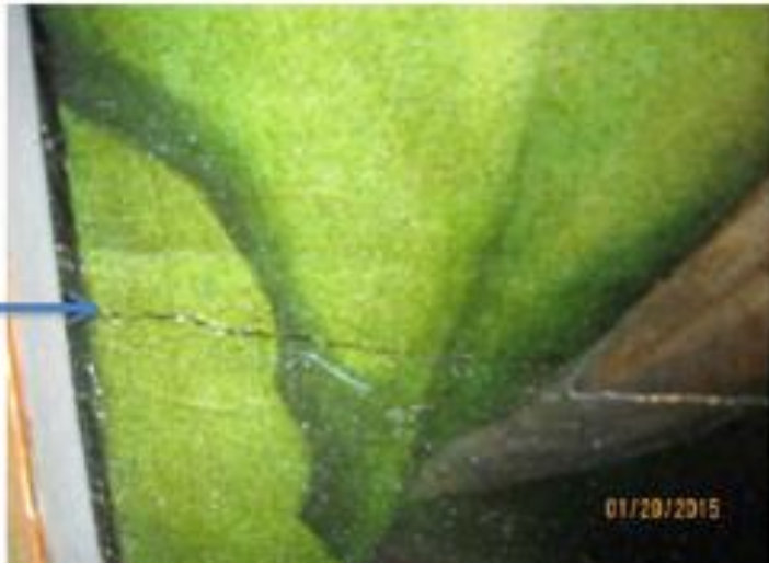
Close up (crack indicated by arrow)