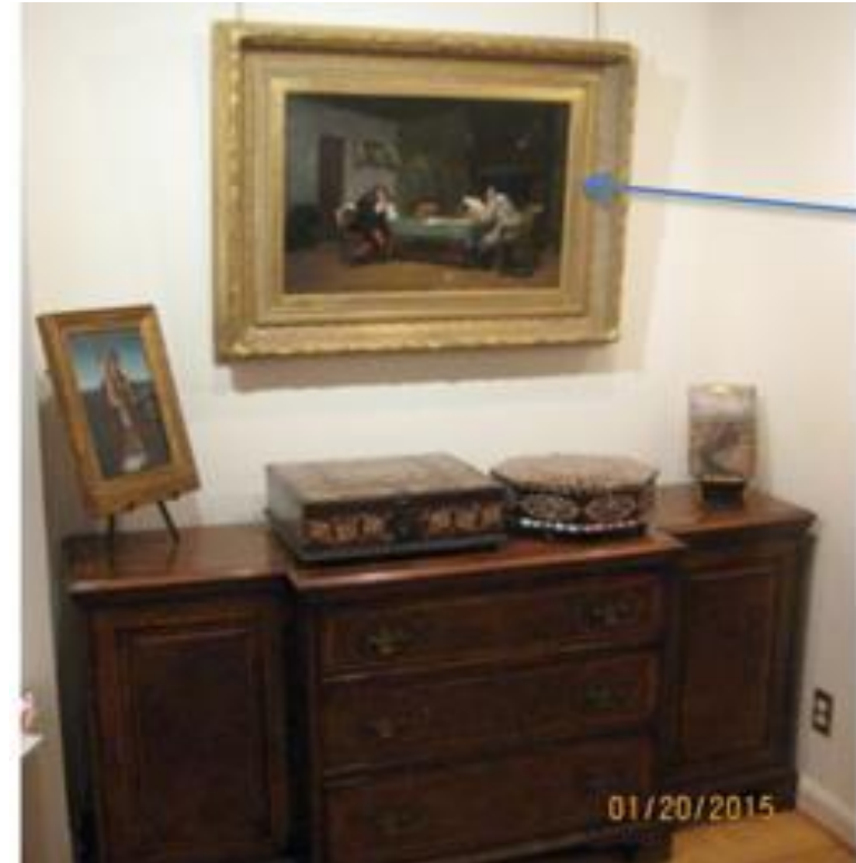
Painting hung above desk