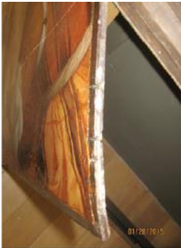
Curve in panel