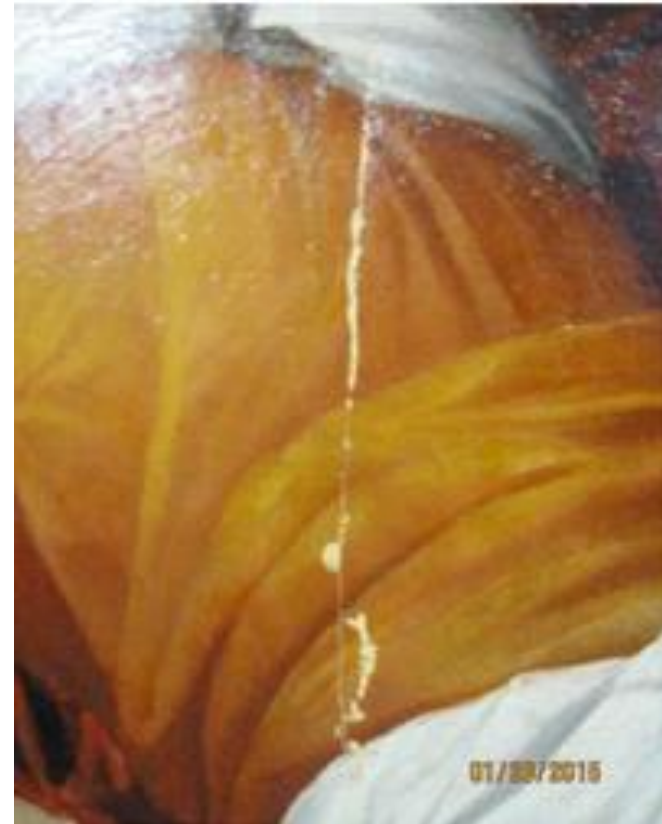
Close up of paint loss